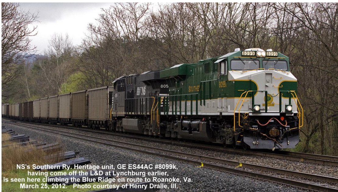
NS's Southern Ry. Heritage unit, GE ES44AC #8099k, having come off the L&D at Lynchburg earlier, is seen here climbing the Blue Ridge en route to Roanoke, Va. March 25, 2012.

Ed. Note - Please note the tree branch stuck in the 8099k's cut lever. You may recall the weather in Central and Southside Virginia the day before was very stormy, the entire area being under a tornado watch most of the day. Thanks, Henry, for the use of your photo!