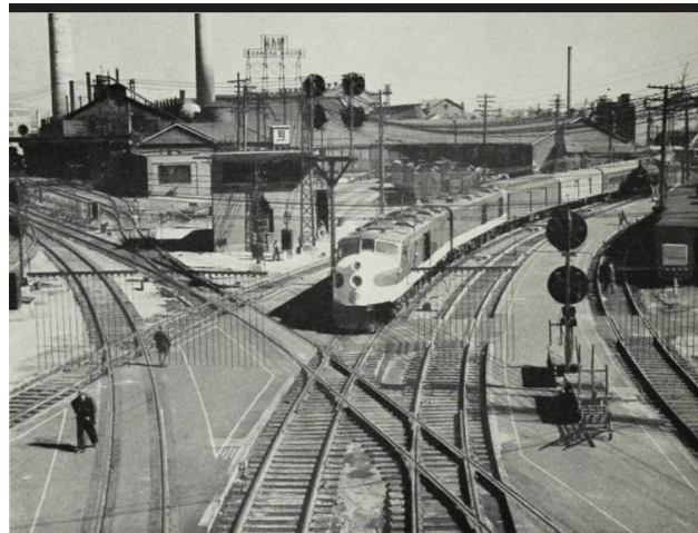
Southern Railway diesels ride the Norfolk & Western

"John L. Lewis, of all people, finally persuaded the Norfolk & Western Railway to do what no locomotive builder has ever been able to: operate diesel road units over its main line in revenue service. All this came about because the Southern Railway's Washington-Memphis passenger route depends upon 203.7 miles of N&W rails between Lynchburg, VA., and Bristol, Va.-Tenn., to carry its Pelican, Birmingham Special, and streamlined Tennessean through to their common destination on the Mississippi. Normal practice is for SR diesels to handle these schedules to Lynchburg, where N&W 4-8-4's take over for the haul through Roanoke to Bristol. There SR has other diesels waiting to forward the trains on to Memphis. But the coal strike early in 1950 kept slashing N&W passenger mileage by I.C.C. directive, while it did not affect SR's diesels one whit. At last N&W permitted the diesels to run right through over its rails, with N&W men aboard to act as guides for the diesel-experienced SR crews. Hence these rare scenes of Alco-GE units in Roanoke with the N&W shops and the road's famous hotel as backdrops. Now the 4-8-4's are back and N&W is happy again."