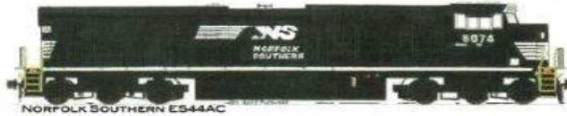
NORFOLK SOUTHERN ES44AC