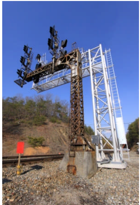
Westbound cantilever with replacement at Chestnut St. 3/12/11

And as an extra bonus, Rick offers us this image of the N&W color position signal at Bowler with thunderstorm in progress. Signal still stands, but not for long as the switch here will be replaced with a hand-throw switch meaning the signal will no longer be necessary. This style of signal is very much an endangered species all over former N&W territory! 6/16/11