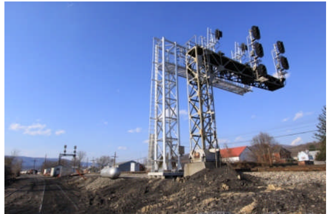
Westbound cantilever with replacement at Chestnut St. 3/12/11