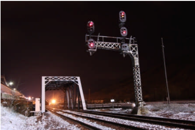
Eastbound cantilever at Jackson River. 12/5/10