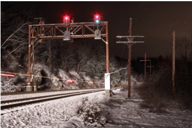
Eastbound coal train lights up the signal bridge at Callegan. Signal caught changing. 12/5/10