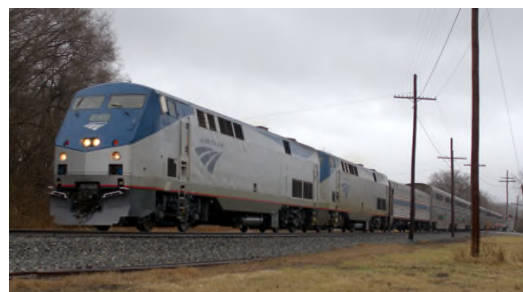
Jan. 5 - Dale Diacont captured an image of Amtrak #51, the Cardinal, operating with Superliner equipment. This was a move by Amtrak because Superliners reportedly do better than Amfleet cars in bitter cold weather.