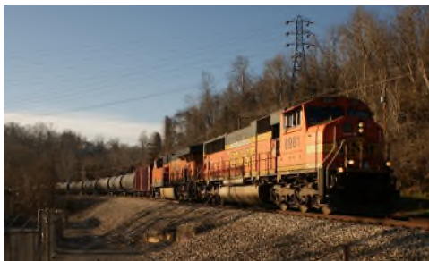
Jan. 1 - Your Editor's first train picture of 2014: BNSF power on a train of crude oil empties.