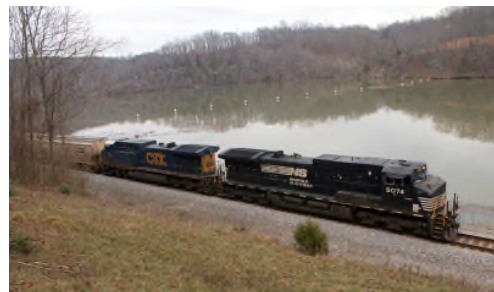
Jan. 2 - NS 9074 leads a grain train, G89831, along the James River.