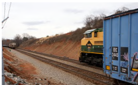
Dec. 30 - Your Editor got skunked by 35Q at Carroll Ave. setting off his Crewe block while waiting for NS 214 with the Reading heritage unit to go north from Montview. Win some. Lose some.